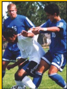
Men's Soccer Team in Home Debut