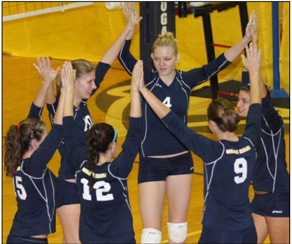
The Laramie County Golden Eagles are in a huddle before the start of a set during a early season match.